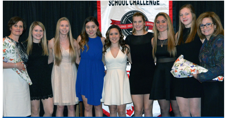
Female World Sport School Challenge Banquet