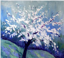
painting participants will create

Purchase tickets at stmarysacademy.mb.ca