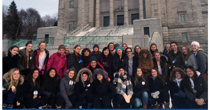
Quebec Trip - February 2016