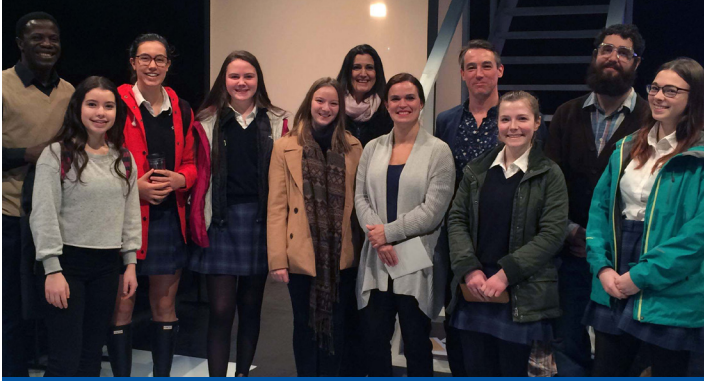
Grades 11/12 AP French class at the performance of L'ennemi du peuple