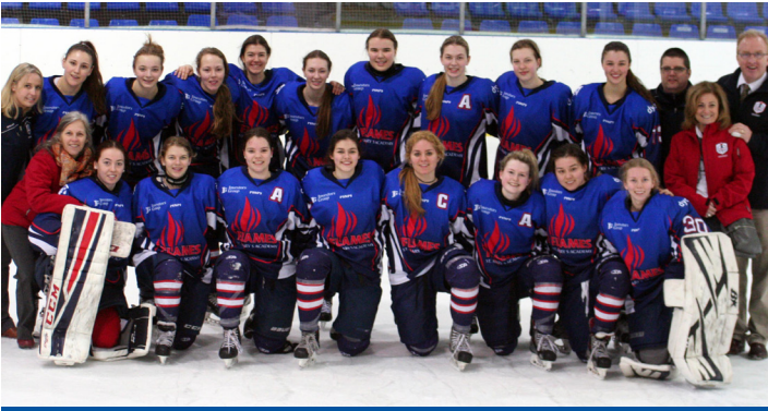
Flames Prep Team in Europe