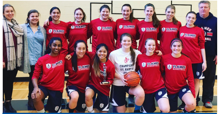
Varsity Basketball Team - SMA Invitational Champions