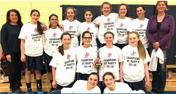
JV Basketball Team - SMA Invitational Champions